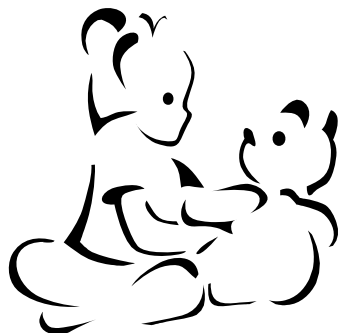
Ascension Church cares deeply for our children's needs

The next step was more difficult. Once we had the building in shape, it still needed to be painted, which the Three Oaks Men volunteered to paint the insides with paint given by Dyson