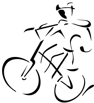
Biking can get you to school and work