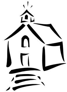
What we are is God's gift to us. What we become is our gift to God. ~Eleanor Powell