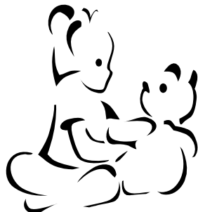
Ascension Church cares deeply for our children's needs

The next step was more difficult. Once we had the building in shape, it still needed to be painted, which the Three Oak Men volunteer to paint the insides with