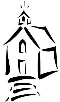
What we are is God's gift to us. What we become is our gift to God. ~Eleanor Powell

You can compile a mailing list from business reply cards, customer information sheets, business cards collected at trade shows, or membership lists.