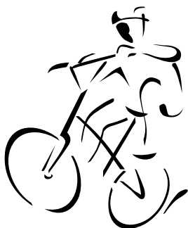
Biking can get you to school and